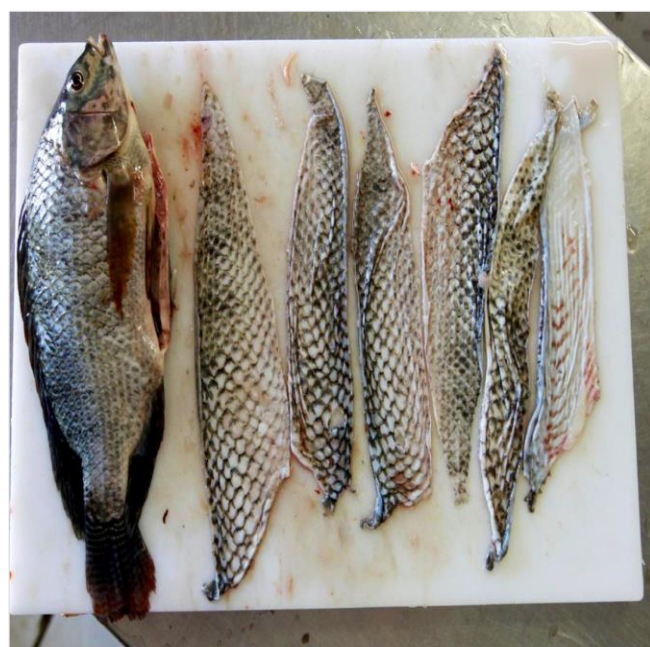
Figure 1 (3)

Nile tilapia fish or oreochromis niloticus is a type of large genus of tilapia, and its exist in large amounts in African coasts and in Australia, the skin of tilapia is very helpful in treating skin burns its rich in type I and III collagen fibers which help in formation of scarring, reduces the pain, less expensive and promote tissue remodeling and take less time.(2)