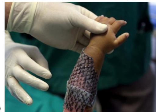
Figure 4 (4)