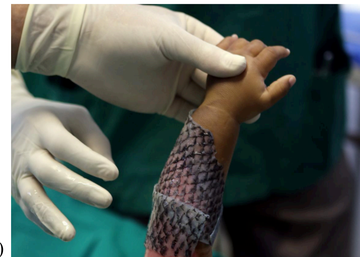
Figure 4 (4)